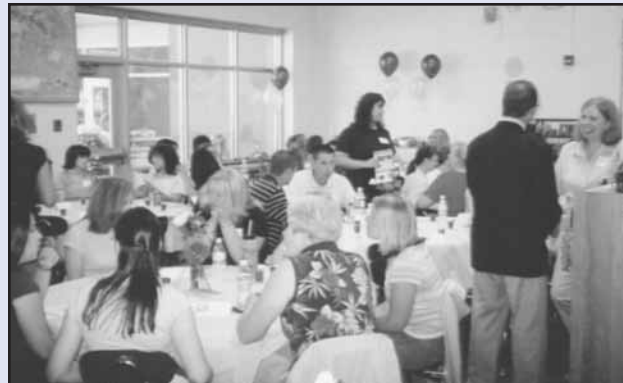
District #109's 2005 – 06 Teacher Mentor and Mentee Meeting

The reality of teaching: Applying theoretical knowledge, developing effective instructional strategies, meeting individual student's needs, incorporating changing curriculum frameworks, developing high stakes assessment, integrating emerging technology, and remaining sensitive to societal issues – can be very challenging for new teachers entering the field. District #109 believes that providing our new teachers with an experienced mentor ensures a successful transition into teaching. On Friday, August 19, 2005, thirty-six new staff members (mentees) came together to meet with their mentors for a full day of introduction into District #109's learning community.