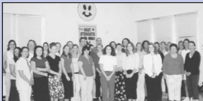
District #109 New Staff Members

We welcome all our new staff members to the district and wish them a most successful and productive school year!