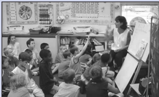
District #109's 2005 – 06 Teacher Mentor and Mentee Meeting

Community members interested in enrolling in any of these workshops are requested to call Missy Baglarz, Technology Trainer, at (708) 496-8700. The workshops are hands-on and are intended for individuals with little or no computer knowledge. Each session is limited to a maximum of 25 participants.