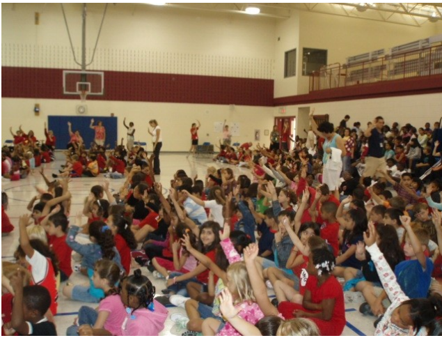
All-school B.E.A.M. assembly to celebrate the end of the first week of school and to introduce the "Cool Tools"!!